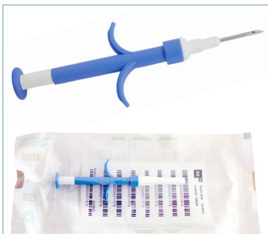
Each syringe is packed in a single pouch with eight barcode stickers