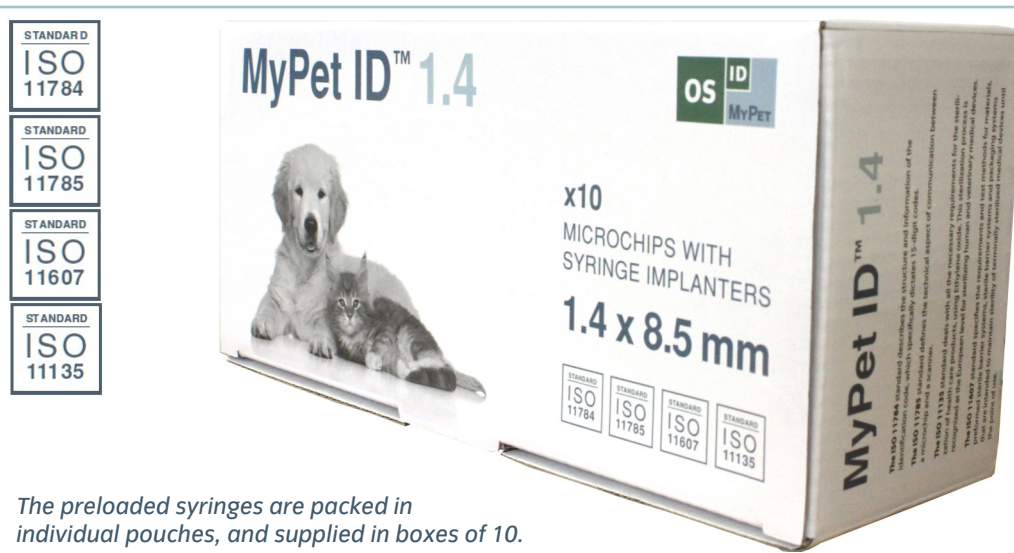
The preloaded syringes are packed in individual pouches, and supplied in boxes of 10.

is a permanent and unique pet identification solution, packed in a preloaded single-use and sterile syringe with a thinner needle.